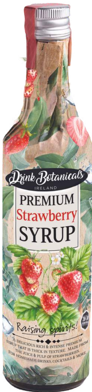
Premium Strawberry Syrup 500ml Case Size: 6 x 500ml units