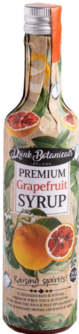
Premium Grapefruit Syrup 500ml Case Size: 6 x 500ml units