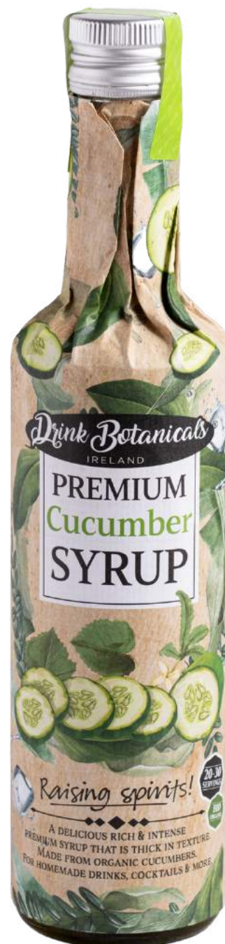
Premium Cucumber Syrup 500ml Case Size: 6 x 500ml units